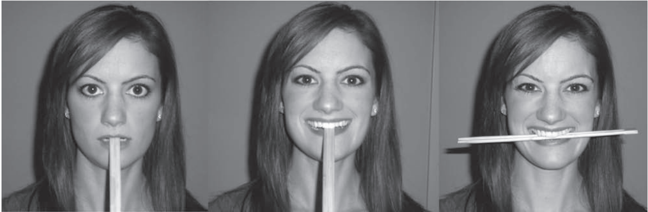
Fig. 1. Examples of photographs shown to participants in the neutral group (left), standard-smile group (middle), and Duchenne-smile group (right) to help them form the appropriate expressions.

that is easily assessed, and it increases in response to a large range of stressors. Following a 10-min resting period, participants completed a 2-min star-tracing task. This stress-inducing task requires participants to place their nondominant hand inside a box and repeatedly trace a star while viewing only a mirror image of the star and their hand. If they strayed from the outline of the star, they received negative auditory feedback. Participants were strongly encouraged to be accurate and were also given incorrect information about performance standards to increase stress (i.e., they were told that the task average was eight tracings with fewer than 25 errors). They were promised an incentive (chocolate) if they could match this unattainable goal. Average participants could complete two tracings in 2 min with over 25 errors. This task was followed by a 5-min recovery period.